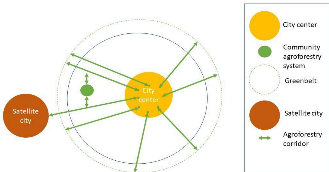
Figure 47. Model for urban and peri- urban agroforestry planning, Paloma Gonzalez de Linares, MATE, 2022

Urban and peri-urban agroforestry should be embedded in planning agendas and regulations as a land use and part of green infrastructure planning with a bottom-up approach through educational programs with participation of citizens and at the watershed scale for water management and a landscape analysis. The farmers should be included in the peri-urban areas in the agroforestry green infrastructure plan.